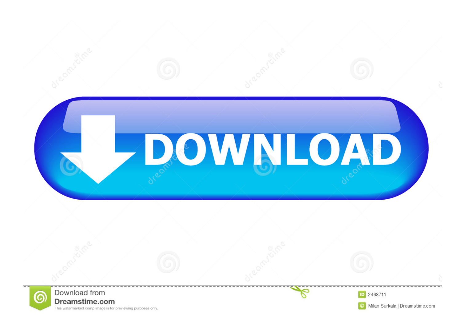
Grade 11 Functions Textbook Mcgraw-hill Ryerson Pdf Free